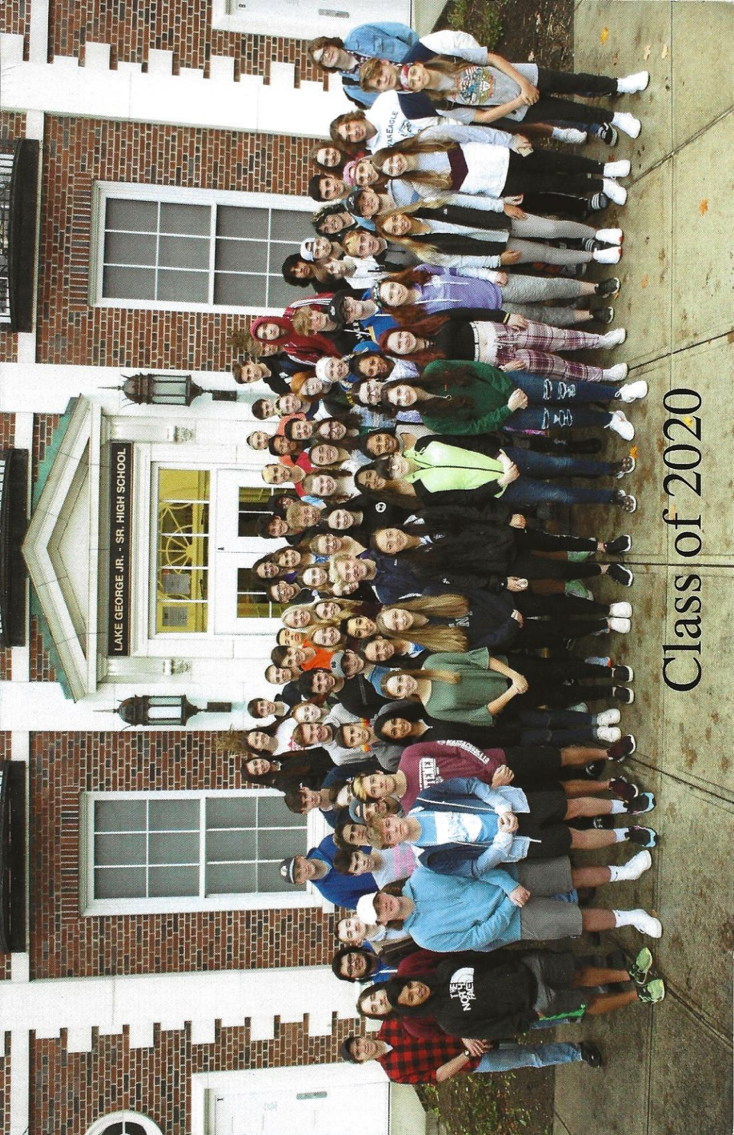
Class of 2020